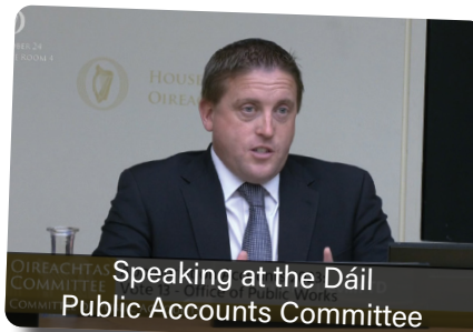
Speaking at the Dáil Public Accounts Committee