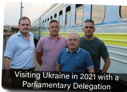
Visiting Ukraine in 2021 with a Parliamentary Delegation