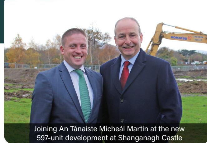
Joining An Tánaiste Micheál Martin at the new 597-unit development at Shanganagh Castle