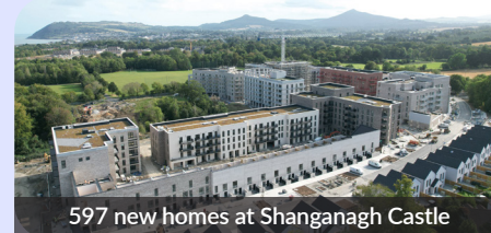
597 new homes at Shanganagh Castle

Under Housing for All, we have delivered 597 new public housing units at Shanganagh Castle. It is the largest public housing scheme since the 1970s and it includes a mix of Social, Cost Rental and Affordable Purchase housing.